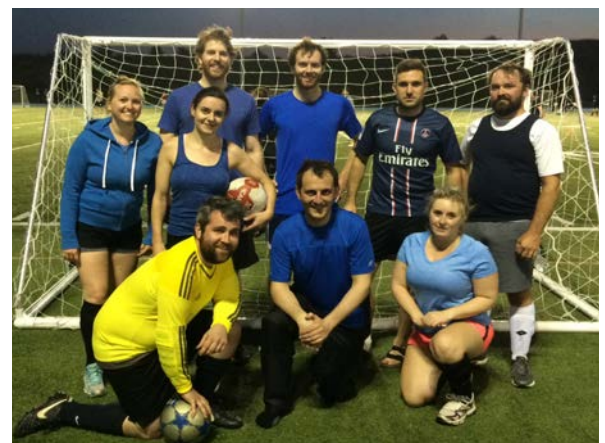
The Socceratic Methods, a team composed of graduate students, alumni and friends of the Department of Classics, competed in a Toronto city soccer league.